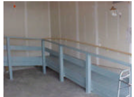
Ramp inside garage