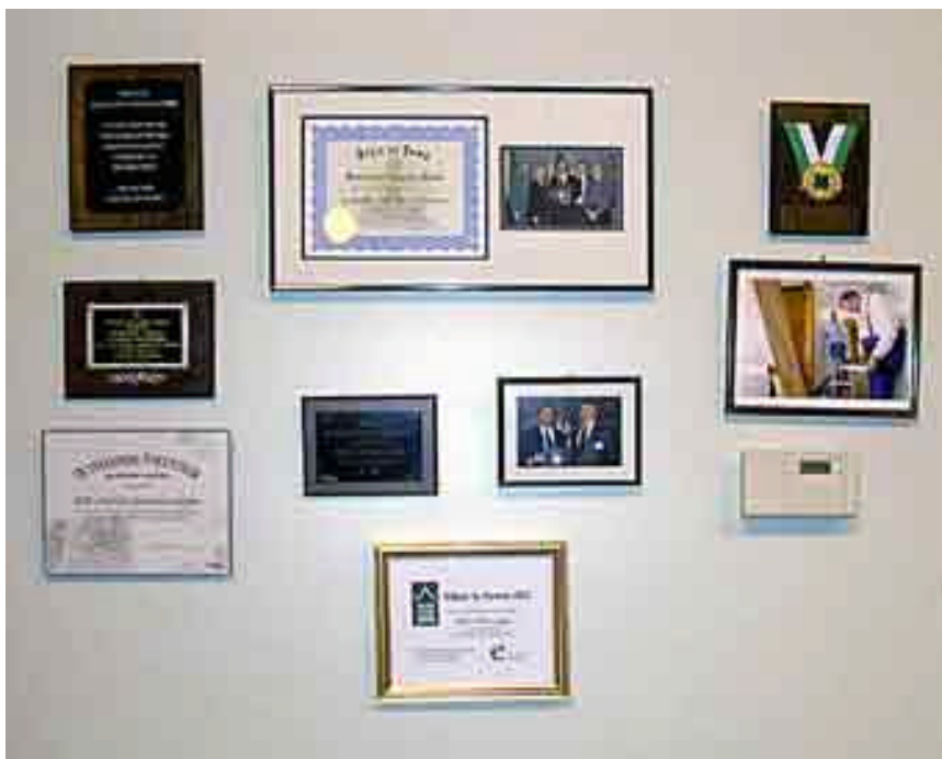
The award wall