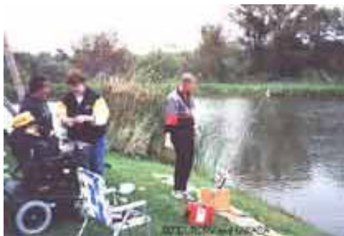
Fishing from a wheelchair