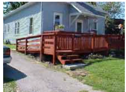
Ramp connected to front deck

Assist with their personal volunteer interests by linking them with RCRV resources and providing insight into community needs.