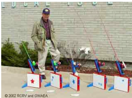
Fishing pole controllers