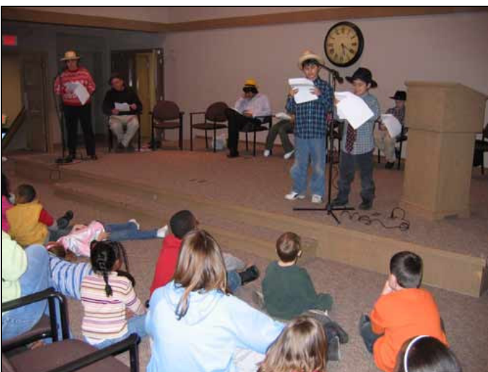
Old Time Radio Show at the Four Oaks Bridge.

The mission of the Four Oaks Bridge is to bring together people of all ages, races and economic backgrounds in an environment of learning whereby youth, seniors and working adults can connect and contribute through the arts, technology, theater and other learning opportunities. Over 80 children currently participate in the various programs at the Bridge Dummermuth Intergenerational Center at 2100 1 st Avenues NE.