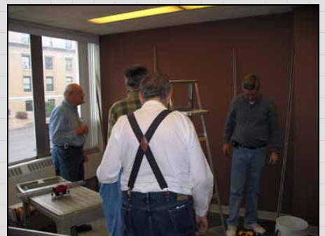
RCRV members move the RSVP offices on December 12