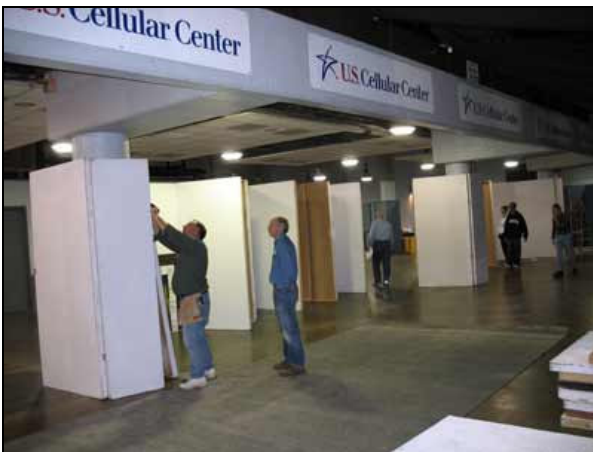
RCRV members constructing Festival of Trees

RCRV members provided the voluntary effort that once again made this a very successful fund raising event by the Auxiliary with proceeds going to fund hospital projects. ♦