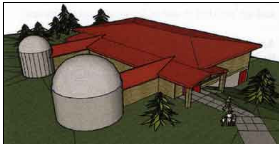
Proposed EIOLC Facility