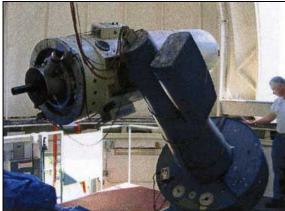
24" Boller & Chivens Telescope

Several Rockwell Collins retirees are active members of CAA which is open to anyone with an interest in astronomy. More information, including specifics of the EIOLC are available on the CAA website www.cedar-astronomers.org . ♦