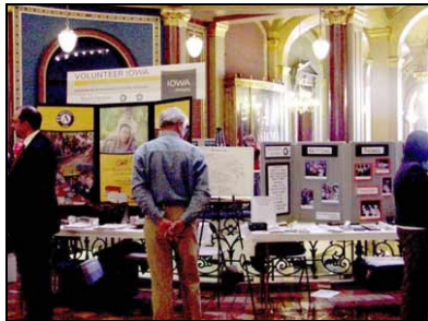
State Capital Volunteer Showcase

Several RCRV members participated in the Volunteer Showcase sponsored by The Iowa Commission on Volunteer Service held at the Iowa State Capital on March 20. The purpose of the event was to provide Legislators and state employees a view of the service and support being provided by volunteer organizations throughout the state. RCRV showcased a variety of our assistive technology devices designed to assist persons with handicaps. ♦