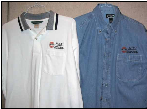
Shirts with the RCRV Logo

RCRV now has shirts available for sale with our organizational Logo displayed on the front. Light blue or dark blue long or short sleeved denim and black or white short sleeved golf shirts are available in sizes small through 2X. Prices for the denim range from $20.50 to $23.50 and for the golf shirts $23.00 to $25.00. Orders may be placed with Arlo Meyer at 393-7461. ♦