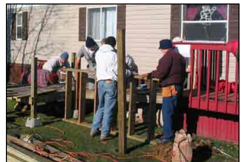
CRCC volunteers construct a wheelchair ramp in SW Cedar Rapids

If you are interested in joining this group for their one-day-a month endeavors contact Chuck Wehage at 319-378-4104 or wehage.chuck@mcleodusa.com . ♦