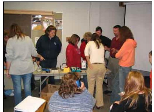
Kirkwood Disabilities Service Class views RCRV assistive devices