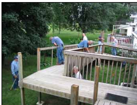
CRCC volunteers dismantle a wheelchair ramp in Marion

Additional members of the Corps are needed so if you are interested in learning some new skills or polishing old ones please contact Chuck Wehage at 319-378-4104 or wehage.chuck@mcleodusa.com .♦