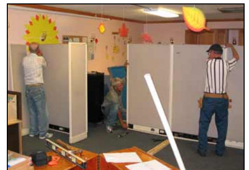
CRCC volunteers construct a room divider at Heart of Iowa