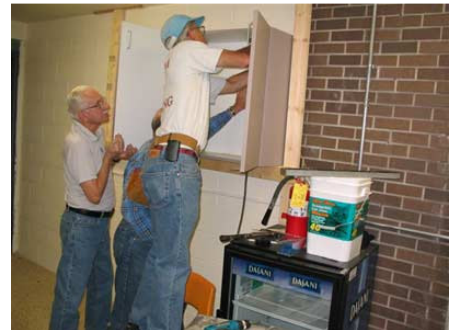
Cabinet installation at Harding Middle School

The server that hosted the RCRV web site has crashed. We are in the process of transferring this web site to a new server. In the mean time some of the functionality including access to the RCRV project data base is not available.♦