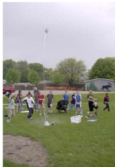
K-12 Rocketry class at Pierce School

Family and friend caregivers provide an invaluable resource to their loved ones. Their courage, compassion and dedication allows the person they are caring for to remain in a loving environment, often at great cost - economic, physical and mental - to the caregiver. This event is being held to recognize and