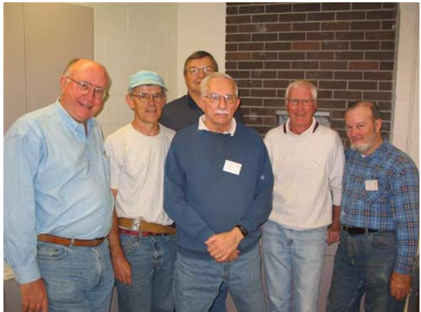
The crew that installed cabinets at Harding Middle School.

Please mark this on your calendars and plan to attend.♦