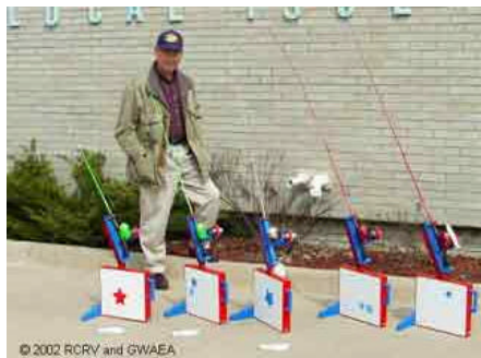
Fishing pole controllers