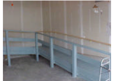
Ramp inside garage